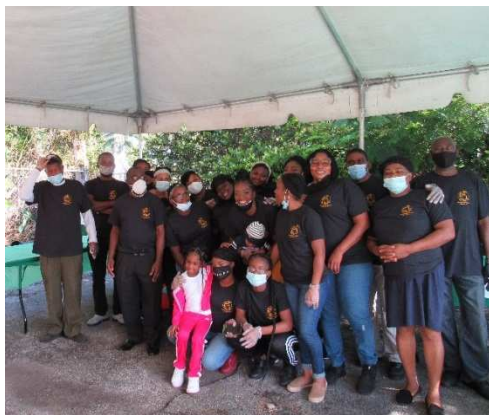
Staff pausing for a picture