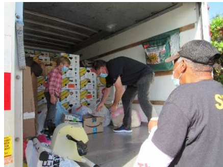
Unloading the truck on site