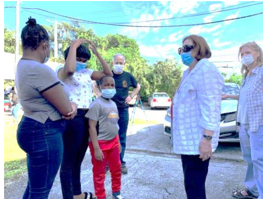
Praying for others