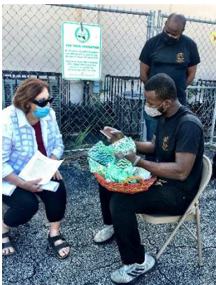
Blessing a family with The Barnabas Basket--

THANK YOU FOR GIVING AND MAKING A DIFFERENCE IN SOMEONE'S LIFE.