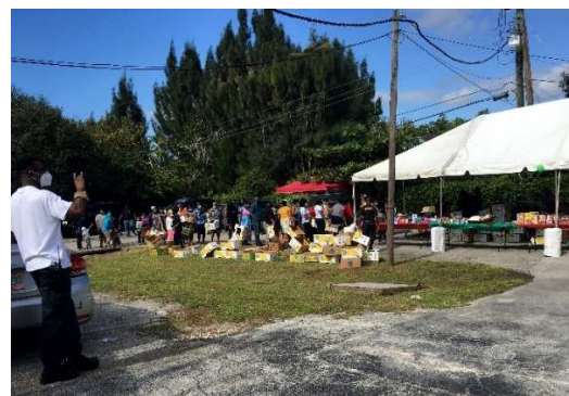
People lining up to enter the large tent